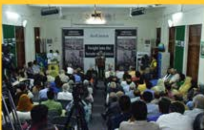
Fully renovated auditorium