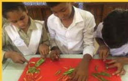
Home Economics Classes