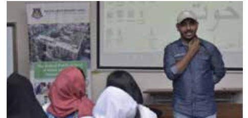
VIDEO MAKING WORKSHOP