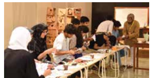
ART THERAPY WORKSHOP