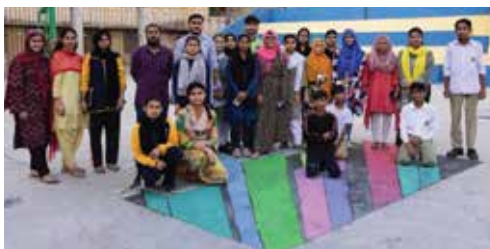
3D ANAMORPHIC WORKSHOP