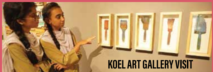
KOEL ART GALLERY VISIT