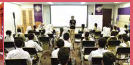
HABIB UNIVERSITY VISIT