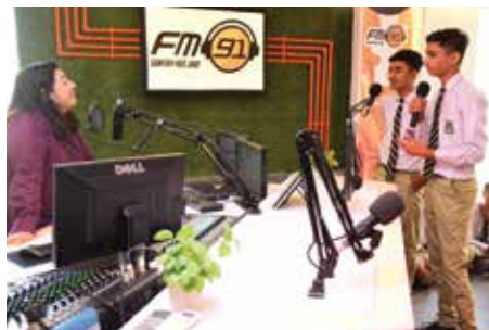
CEP Music Students Visited FM Radio 91