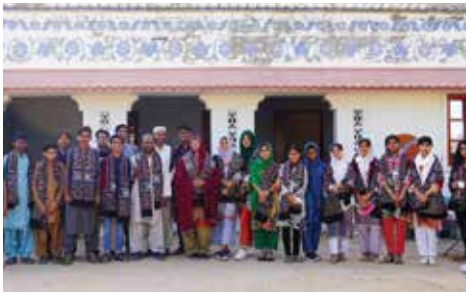
Hostel Students Visit to Sobhay Jo Tarr