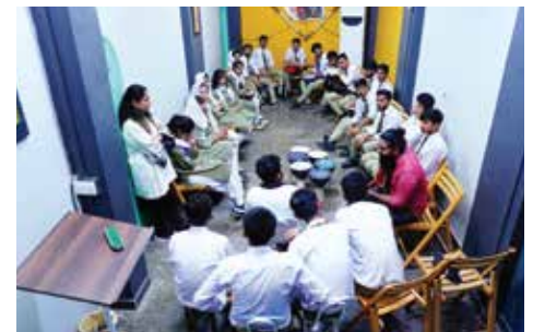
Music Students Visit Mehr Ghar, Lyari