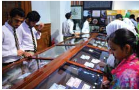
XII Students Field Trip to State Bank of Pakistan Museum