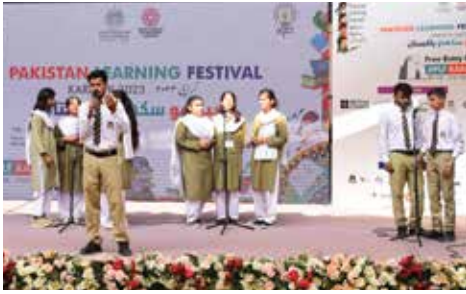
Fine Arts Students Visited the PLF at Art Council