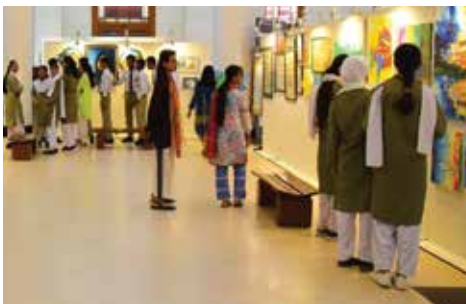
CEP Arts Students Visited Sambara Art Gallery