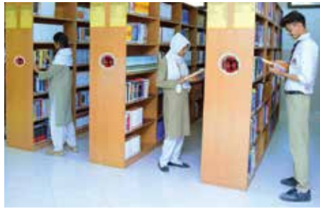
XII Students Visit IoBM