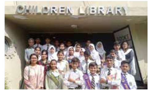
Grade VII Students Visit to Children Library Visit