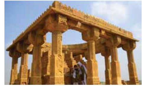
CEP Photography Students Field Trip to Chaukundi Tombs