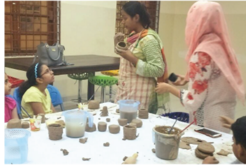
Art and Craft Workshop (11th to 14th June)

An exciting week-long journey summer program with NJV was organized, where participants nurtured their sense of wonder and sharpened their critical thinking skills.