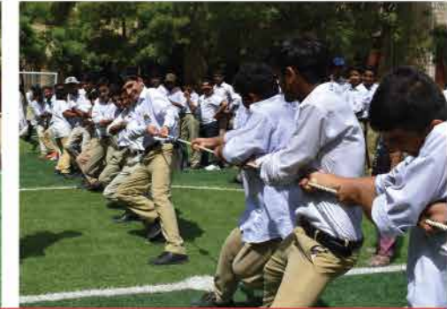
At NJV, we believe in sports and extracurricular activities. Therefore, we organized a Sports Day in which students and teachers participated!