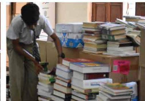
NJV School is renovating a beautiful Library. For that, students of NJV, DCTO and Cedar College volunteered in the book sorting and shelving.