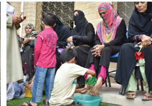
Some people in China have begun teaching children to wash their mother's feet to express their gratitude. For the first time, we also followed the ritual.