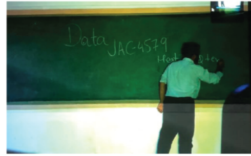
Teacher is projected onto the board - he is not there