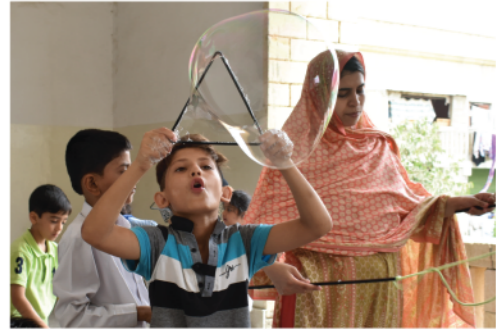
Science Fuse Workshop (4th to 9th June)

An exciting week-long journey summer program with NJV was organized, where participants nurtured their sense of wonder and sharpened their critical thinking skills.