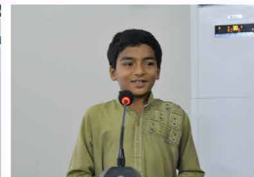
At NJV, we believe that students lead a purposeful life. For that, we have Vision Classes every Saturday, where we call in guest speakers to expose them to different careers and prompt them to think about their future!