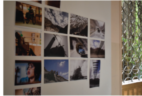
Photography Exhibition and Competition (3rd to 10th May)

Art and Craft summer workshops organized by NJV-CVA (College of Visual Arts) instructed by Ayesha Sabih and Aaniqa sohail. Medium: oil pastels – watercolor painting – foil art – clay.