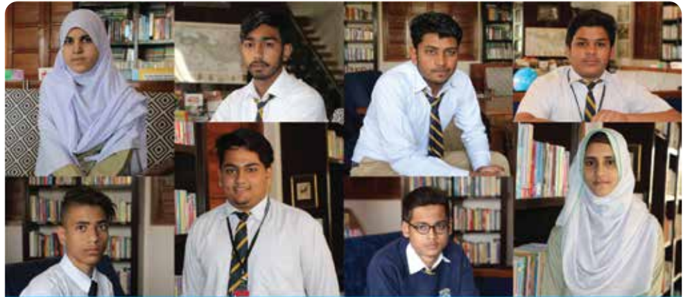
High achieving students of NJV Govt. Higher Secondary School

I have worked on different research projects. One of my collaborative work as co-author is recently published in an International Journal Scientific Reports - Nature entitled "Purification and Characterization of a Nonspecific Lipid Transfer Protein 1 (nsLTP1) from Aijwain ( Trachyspermum ammi ) Seeds". The plant nsLTPs are well-known for their antibacterial, and anti-cancer activities. This study revealed that aijwain non-specific lipid transfer protein has possible application in drug delivery application.