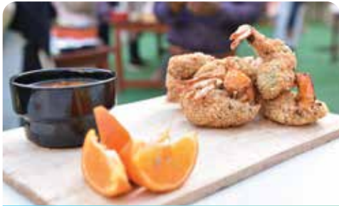
Appetizer by NJV Chefs

Doesn't your mouth water at the sight of scrumptious, delicious food? However, will you be shocked if we tell you that students of around 13-14 years made it?