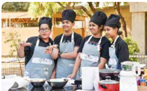
Runner-up: Haque Academy