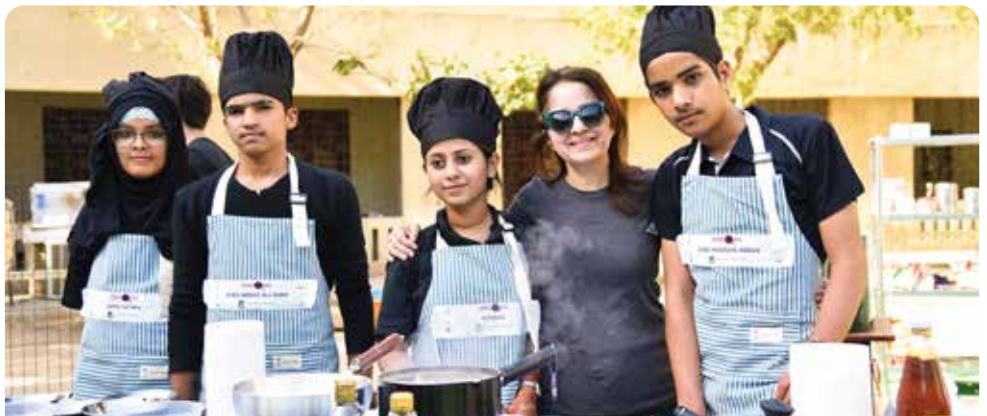
NJV MasterChef 2019 Winner - NJV Team