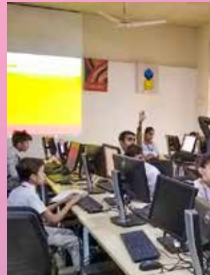
Web & Graph