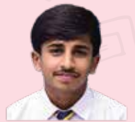
NOOR NABI SCORED 175 OUT OF 200